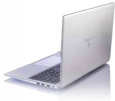
TAGITOP ® -PLUS (Laptop)