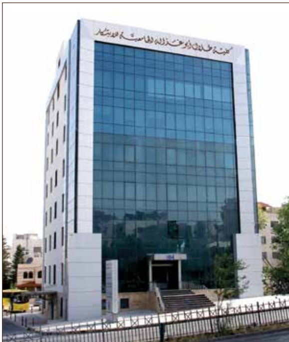
Talal Abu-Ghazaleh University College for Innovation, Amman

104 Mecca Street, Um-Uthaina, Amman, Jordan P.O. Box: 921951 Amman 11192, Jordan Tel: +962 6 5100 900 Fax: +962 6 5100 901 info@taguci.edu.jo tag.global