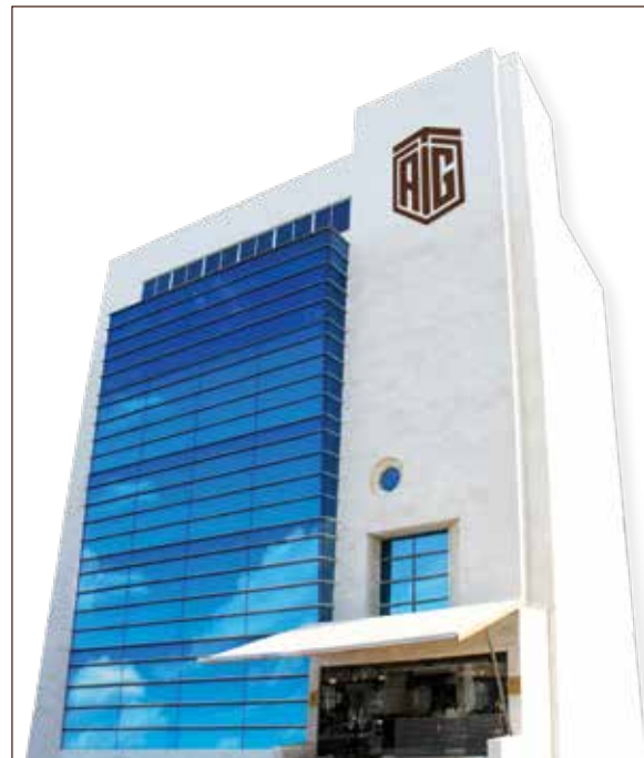
Our Global Headquarter, Amman

104 Mecca Street, Um-Uthaina, Amman, Jordan P.O. Box: 921951 Amman 11192, Jordan Tel: +962 6 5100 900 Fax: +962 6 5100 901 info@taguci.edu.jo tag.global