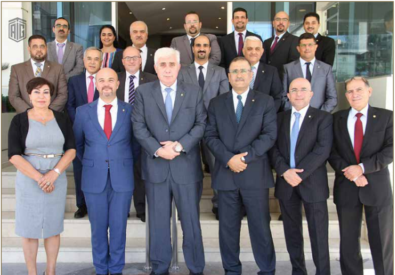
TAG.GLOBAL MANAGEMENT BOARD - 2019