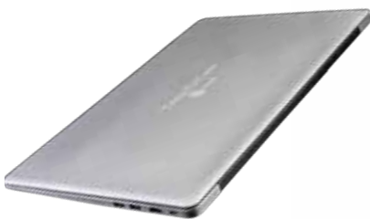
TAGITOP ® -MULTI (Laptop)

TAGTech products are the best solution during a crisis due to their high-specs and competitive prices.